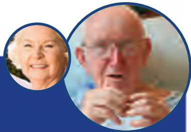
Resident to Staff